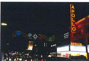
2017 Holiday Lights Street Lights