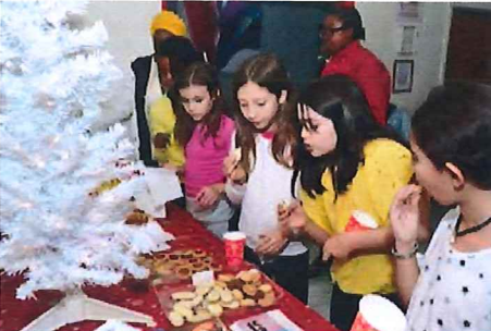
2017 Childrens Village